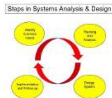
Figure 1: Steps in System Analysis and Design

This stage involves all levels of the organization, to collaborate the business needs and the overall ability to develop the new information system.